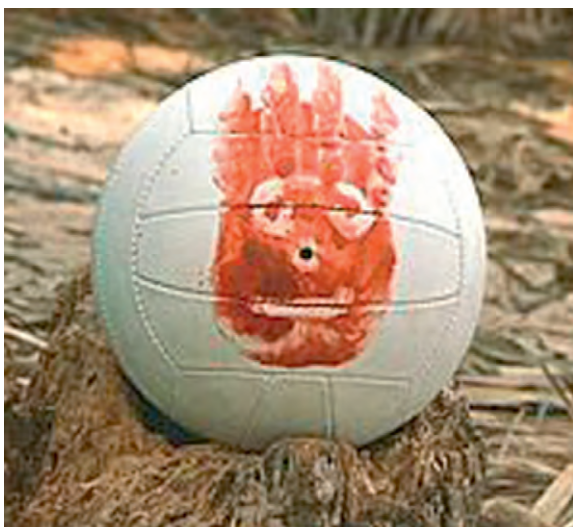
TRENDS in Cognitive Sciences

Social motivation thus appears to function like other basic homeostatic systems: relative deprivation gives rise to negative feelings that signal to the individual that her needs are not met, and a sophisticated psychological machinery is then triggered in an attempt to restore balance in the system (by increasing orientating, seeking, and maintaining behaviors).